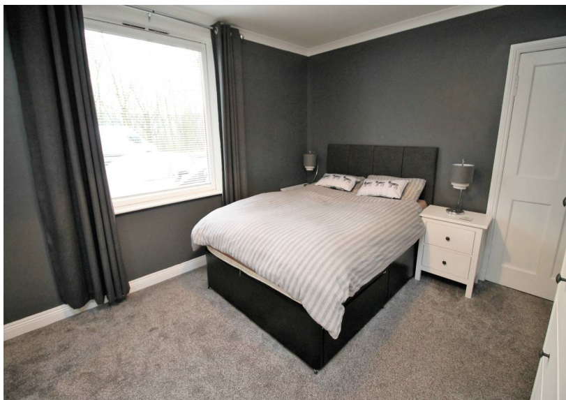
Bedroom one :