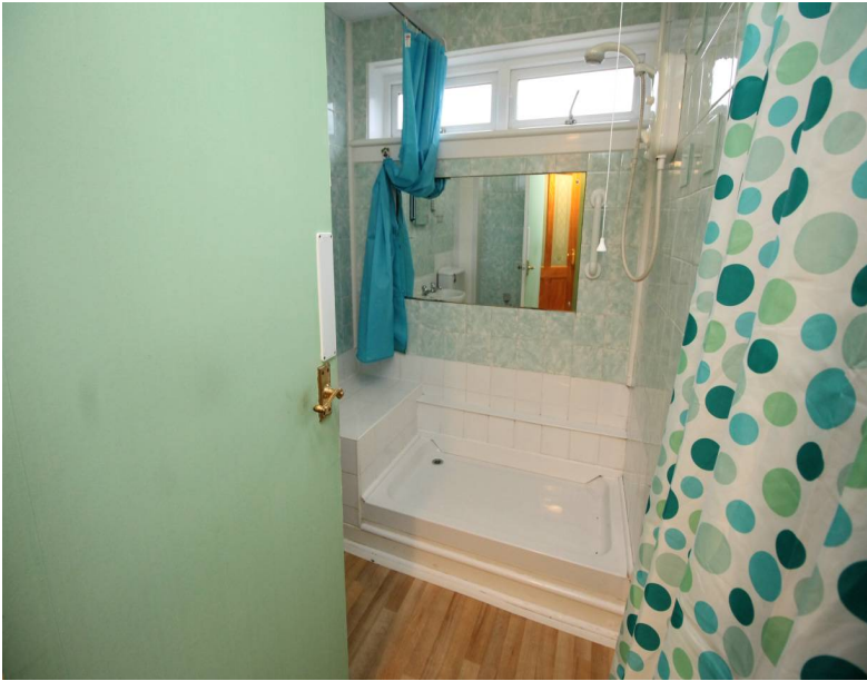
Shower room :