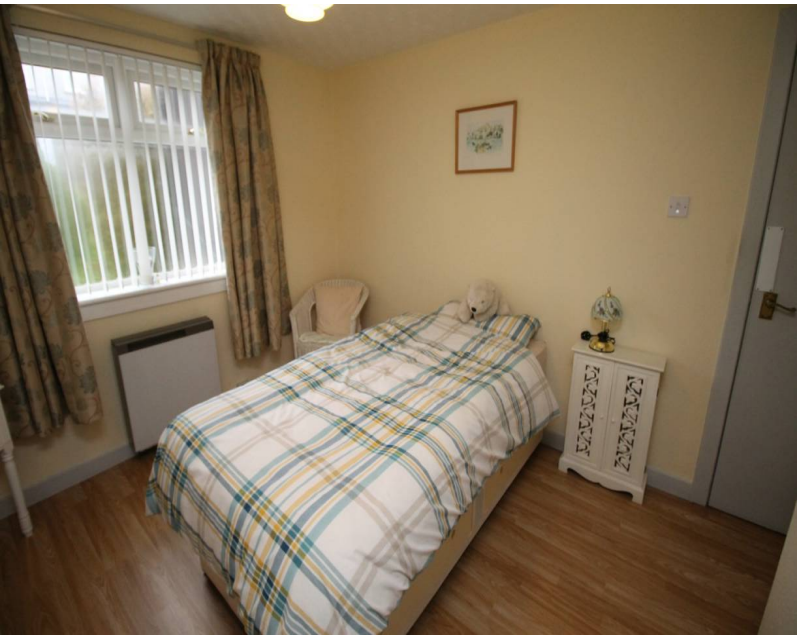
Bedroom one :